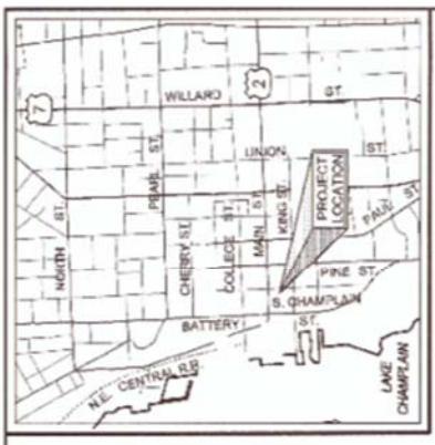
- Location Map - NOT TO SCALE

30 - 42 King St. Burlington Housing Authority Vol. 1127 Pg. 177