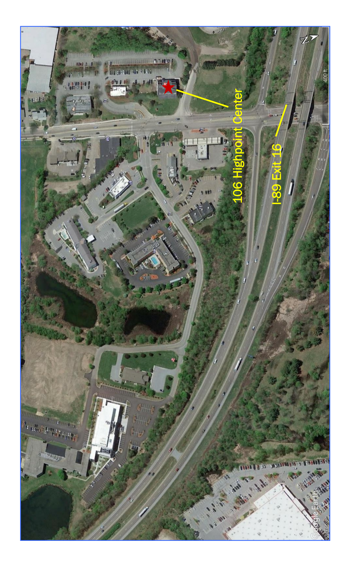
Information contained herein was provided by sources considered generally reliable, but is offered without any warranty, either explicit or implied.